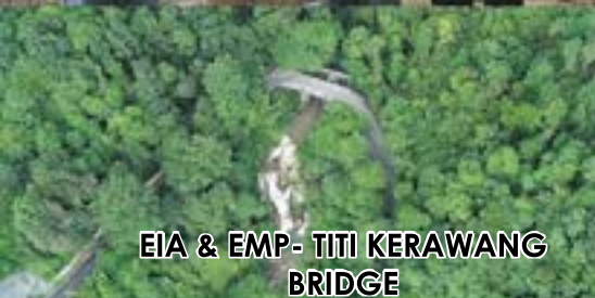
EIA & EMP - TITI KERAWANG BRIDGE