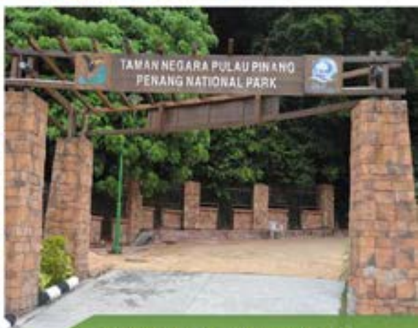
FEASIBILITY STUDY FOR TAMAN NEGARA