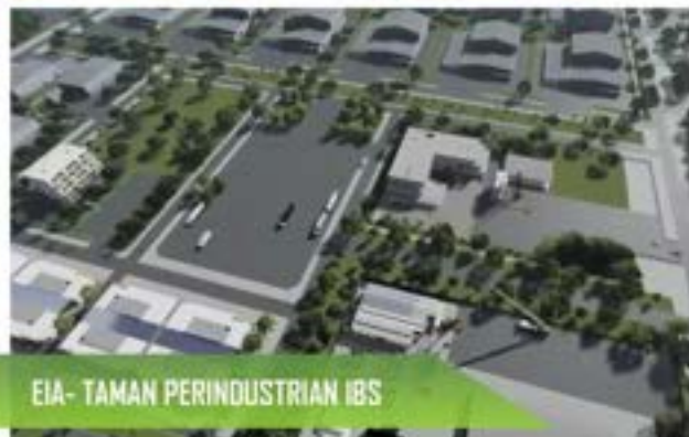
EIA- TAMAN PERINDUSTRIAN IBS