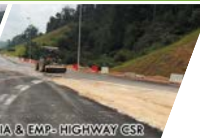
EIA & EMP- HIGHWAY CSR