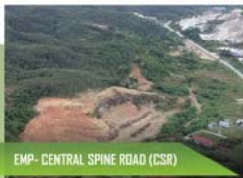
EMP- CENTRAL SPINE ROAD (CSR)