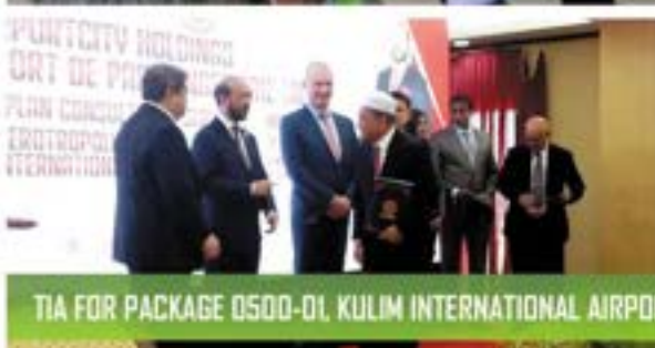
TIA FOR PACKAGE 0500-D1, KULIM INTERNATIONAL AIRPORT