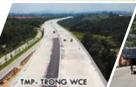
TMP- TRONG WCE