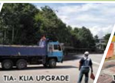
TIA- KLIA UPGRADE