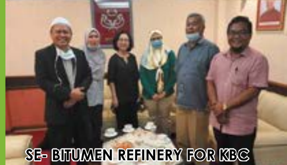
SE - BITUMEN REFINERY FOR KBC