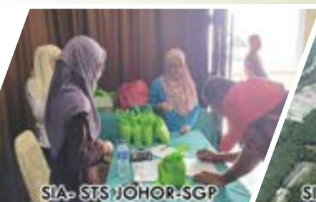
SIA- STS JOHOR-SGP