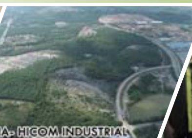
SIA- HIGOM INDUSTRIAL