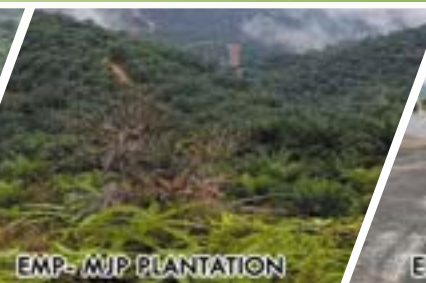
EMP- MJP PLANTATION