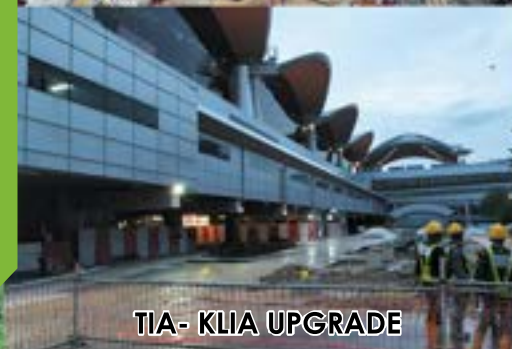
TIA - KLIA UPGRADE