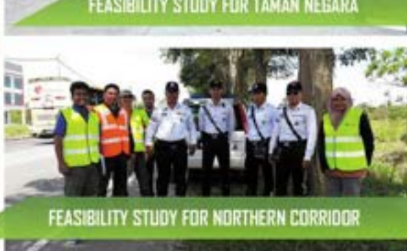
FEASIBILITY STUDY FOR NORTHERN CORRIDOR