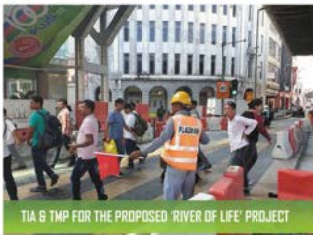
TIA & TMP FOR THE PROPOSED 'RIVER OF LIFE' PROJECT