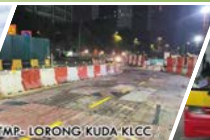
TMP- LORONG KUDA KLCC