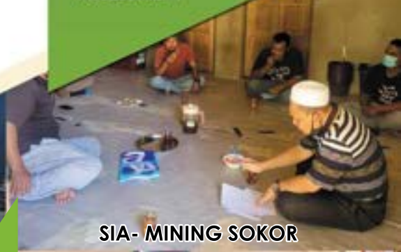
SIA - MINING SOKOR