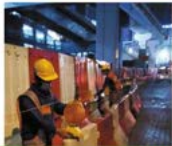
TMP- LORONG KUDA PERSIARAN KLCC