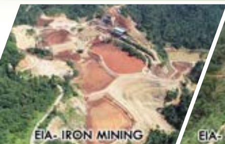
EIA- IRON MINING