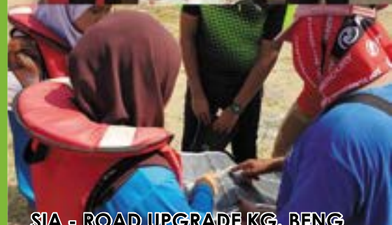
SIA - ROAD UPGRADE KG. BENG