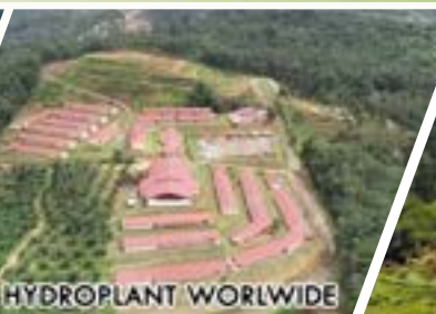
EIA- HYDROPLANT WORLDWIDE