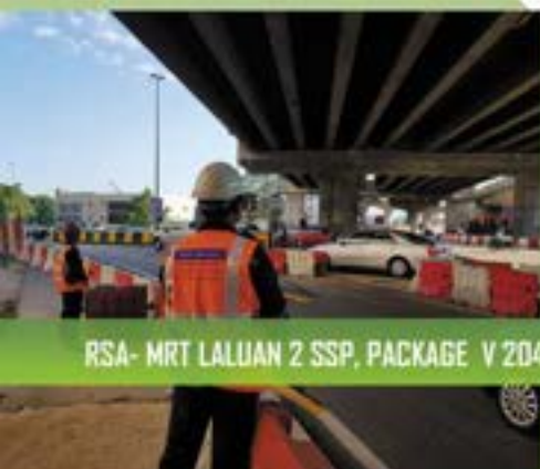
RSA- MRT LALUAN 2 SSP, PACKAGE V 204