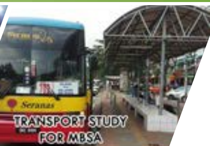
TRANSPORT STUDY FOR MBSA