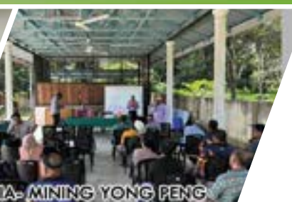
SIA- MINING YONG PENG