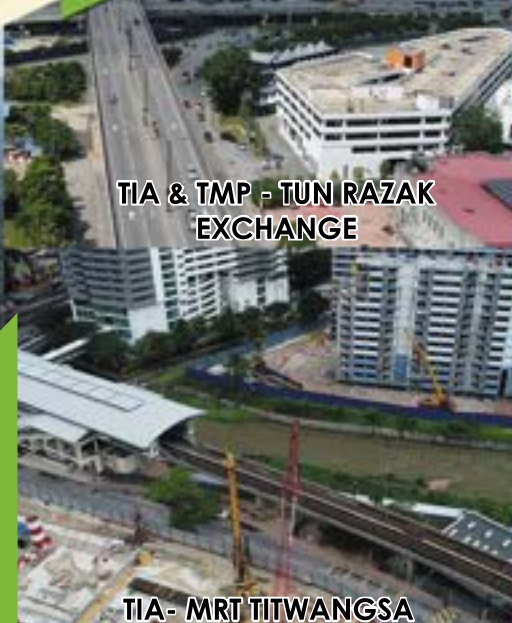
TIA - MRT TITWANGSA