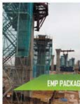
EMP PACKAGE BOT202 FOR MRT CORPORATION