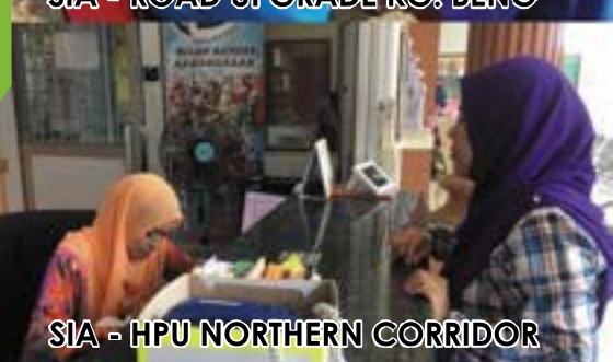
SIA - HPU NORTHERN CORRIDOR