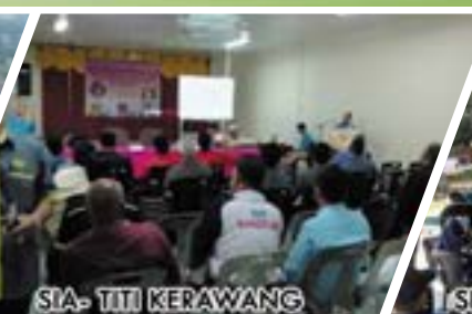
SIA- TITI KERAWANG