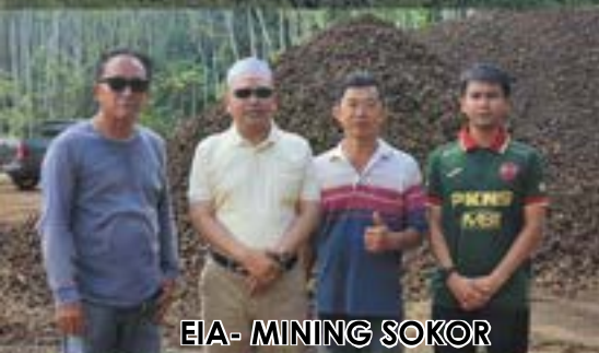
EIA - MINING SOKOR