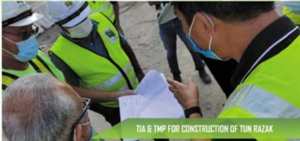
TIA & TMP FOR CONSTRUCTION OF TUN RAZAK