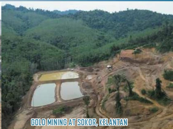
GOLD MINING AT SOKOR, KELANTAN