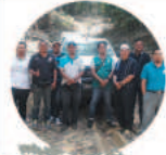
Environmental Impact Assessment