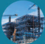
Civil & Structural

NRI Holdings Sdn. Bhd. contribute to the creation of infrastructure that best meets the unique demands of its environment. We provides contractors and engineers as they are problem solvers and able to understand infrastructure life cycles. When compared and contrasted to design engineers, construction engineers bring to the table their own unique perspectives for solving technical challenges with clarity and imagination.