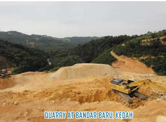
QUARRY AT BANDAR BARU, KEDAH