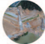
Environmental Management Plan