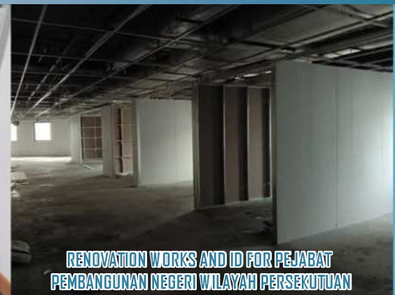
RENOVATION WORKS AND ID FOR PEJABAT PEMBANGUNAN NEGERI WILAYAH PERSEKUTUAN