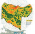
GIS & Geospatial Solution