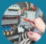
Mechanical & Electrical