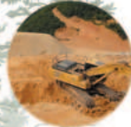
Quarry & Mining