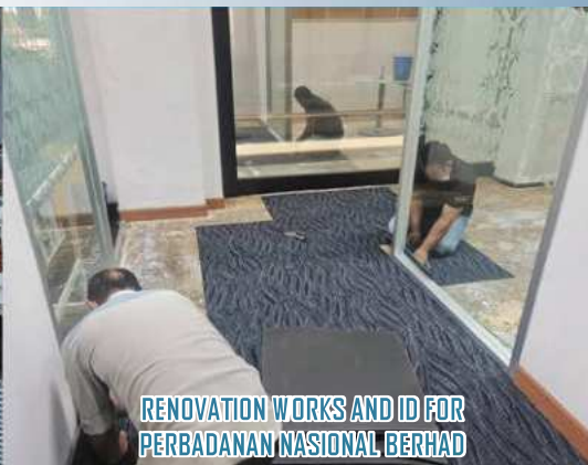
RENOVATION WORKS AND ID FOR PERBADANAN NASIONAL BERHAD