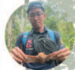
Flora & Fauna Study