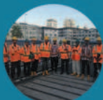
Safety & Health Officer