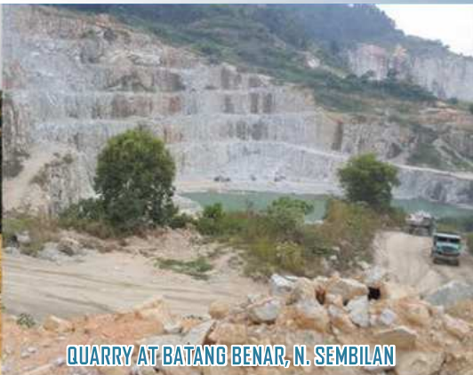
QUARRY AT BATANG BENAR, N. SEMBILAN