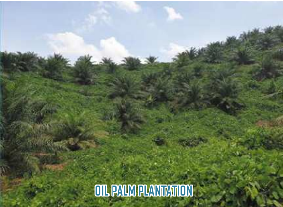
OIL PALM PLANTATION