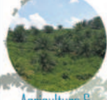
Agriculture & Plantation