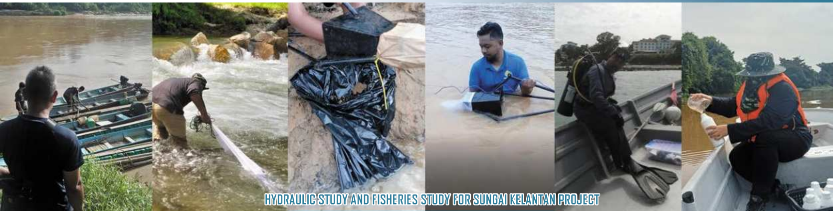
HYDRAULIC STUDY AND FISHERIES STUDY FOR SUNGAI KELANTAN PROJECT