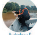
Hydrology & Marine Study