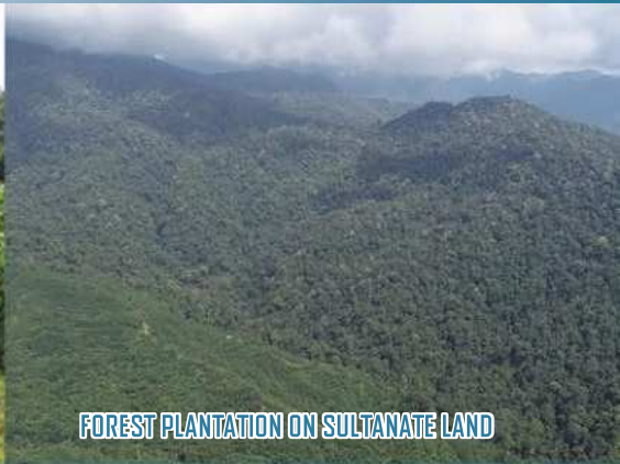
FOREST PLANTATION ON SULTANATE LAND