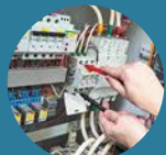
Mechanical & Electrical