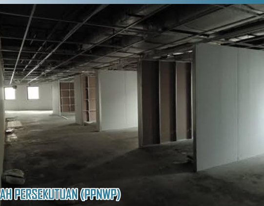
RENOVATION WORKS AND INTERIOR DESIGN FOR PEJABAT PEMBANGUNAN NEGERI WILAYAH PERSEKUTUAN (PPNWP)