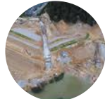
Environmental Management Plan