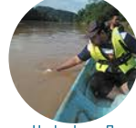
Hydrology & Marine Study