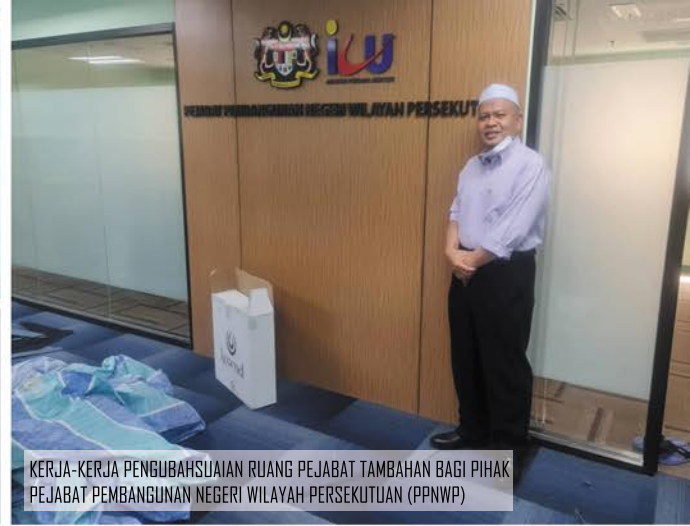
KERJA-KERJA PENGUBAHSAJIAN RUANG PEJABAT TAMBAHAN BAGI PIHAK PEJABAT PEMBANGUNAN NEGERI WILAYAH PERSEKUTUAN (PPNWP)