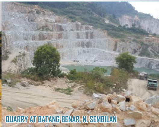
QUARRY AT BATANG BENAR, N. SEMBILAN