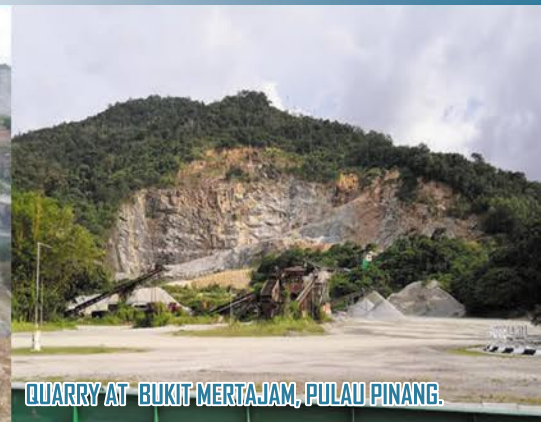
QUARRY AT BUKIT MERTAJAM, PULAU PINANG