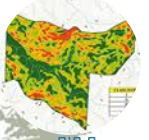
GIS & Geospatial Solution