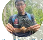
Flora & Fauna Study