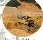
Quarry & Mining