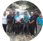
Environmental Impact Assessment