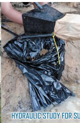
HYDRAULIC STUDY FOR SUNGAI KELANTAN PROJECT