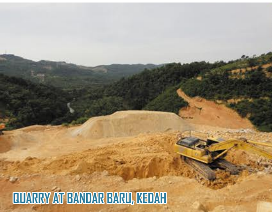
QUARRY AT BANDAR BARU, KEDAH