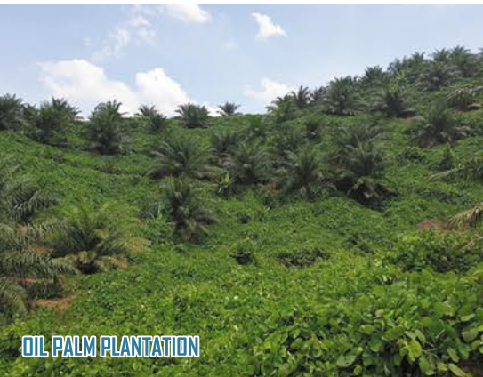
OIL PALM PLANTATION