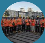
Safety & Health Officer