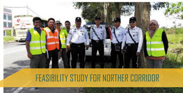
FEASIBILITY STUDY FOR NORTHER CORRIDOR