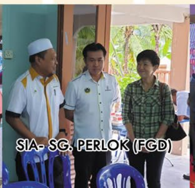
SIA- SG. PERLOK (FGD)