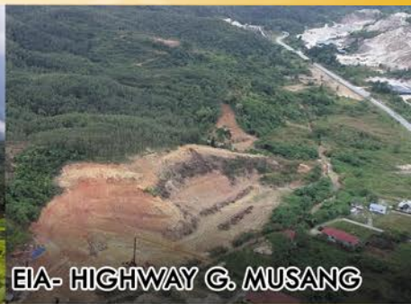
EIA- HIGHWAY G. MUSANG