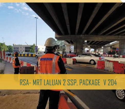
RSA- MRT LALUAN 2 SSP, PACKAGE V 204