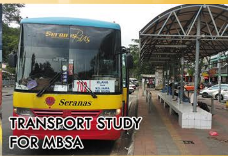
TRANSPORT STUDY FOR MBSA