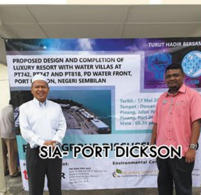
SIA- PORT DICKSON