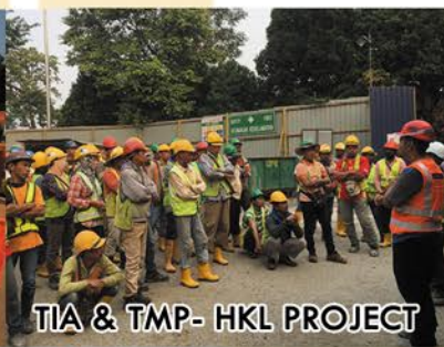
TIA & TMP- HKL PROJECT