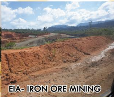
EIA- IRON ORE MINING