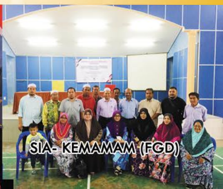
SIA- KEMAMAM (FGD)