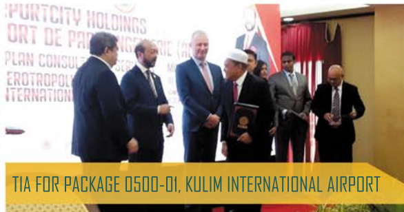
TIA FOR PACKAGE 0500-01, KULIM INTERNATIONAL AIRPORT