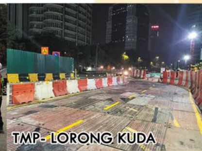
TMP- LORONG KUDA