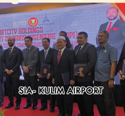
SIA- KULIM AIRPORT