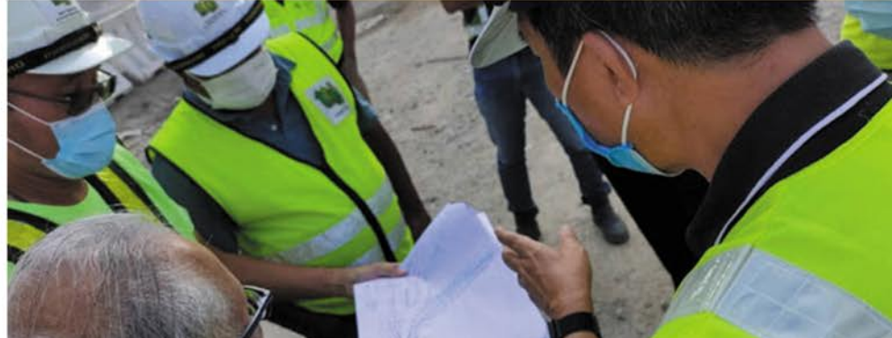
TRAFFIC STUDY & TRAFFIC MANAGEMENT FOR TRX PROJECT