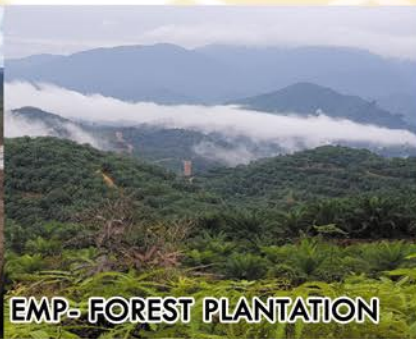
EMP- FOREST PLANTATION